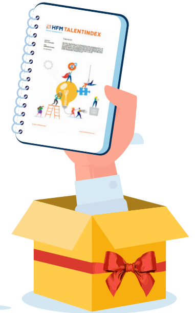
Always give the gift of TalentGO!

With the TalentGO, a candidate has a tool to reflect on their own strengths. This enables you to quickly go deeper during a selection interview. More insight for the recruiter and the candidate.